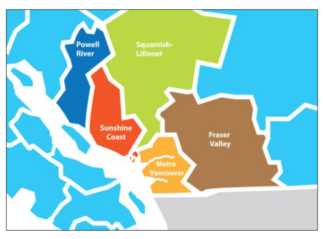
The SWBC Bioregion includes Metro Vancouver, the Fraser Valley, Sunshine Coast, Squamish Lillooet, and Powell River Regional Districts, and the traditional territories of the Coast Salish People

Bioregions are areas that share similar topography, plant and animal life, and human culture. They are largely based on eco-regions but also incorporate human settlement areas, activity patterns, and political boundaries. The SWBC Bioregion includes Metro Vancouver, the Fraser Valley, Sunshine Coast, Squamish Lillooet, and Powell River Regional Districts, and the traditional territories of the Coast Salish People.