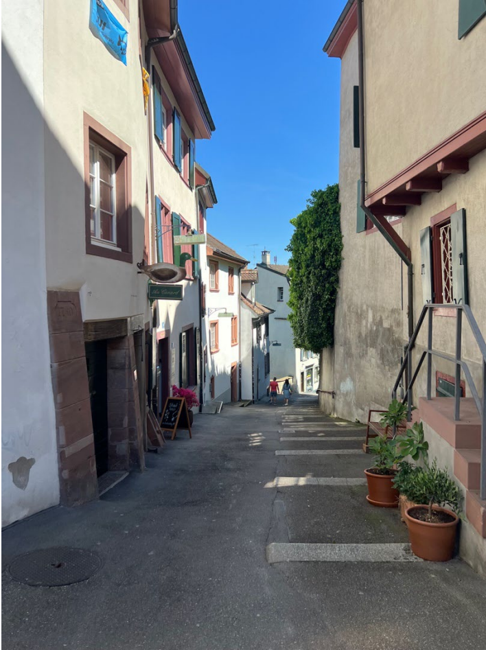
Street in Basel