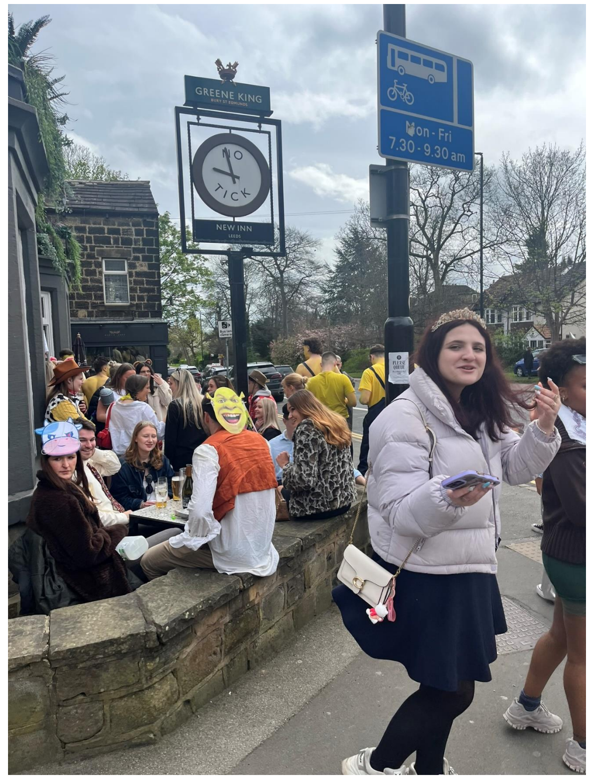
Otley Run is a famous pub crawl in Leeds that people do on the weekends and the rule is to always be uin some sort of costume, rain or shine.