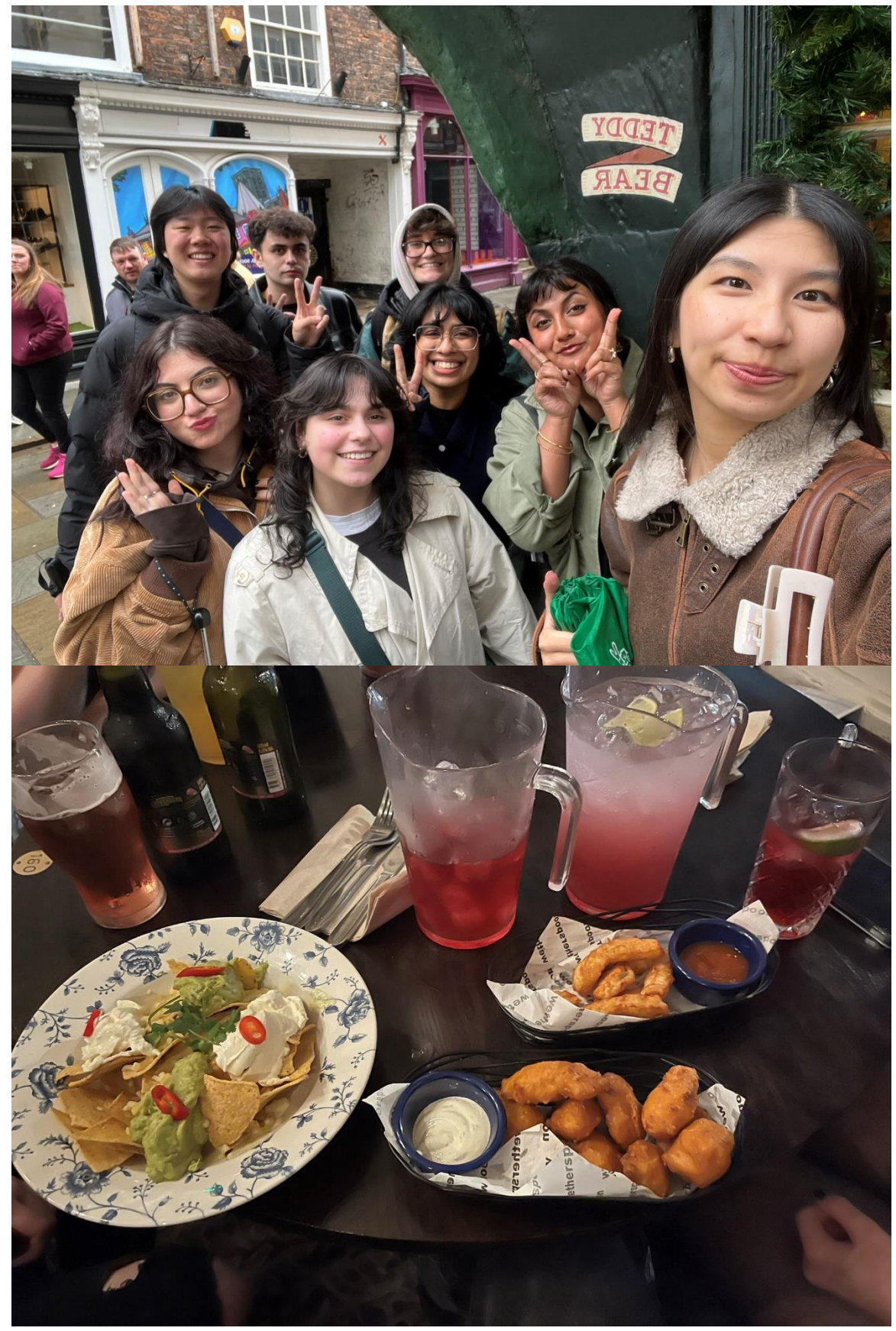
Above: group trip to York with friends, Below: Pub food from Spoons

Internationalprograms@kpu.ca www.kpu.ca/studyabroad