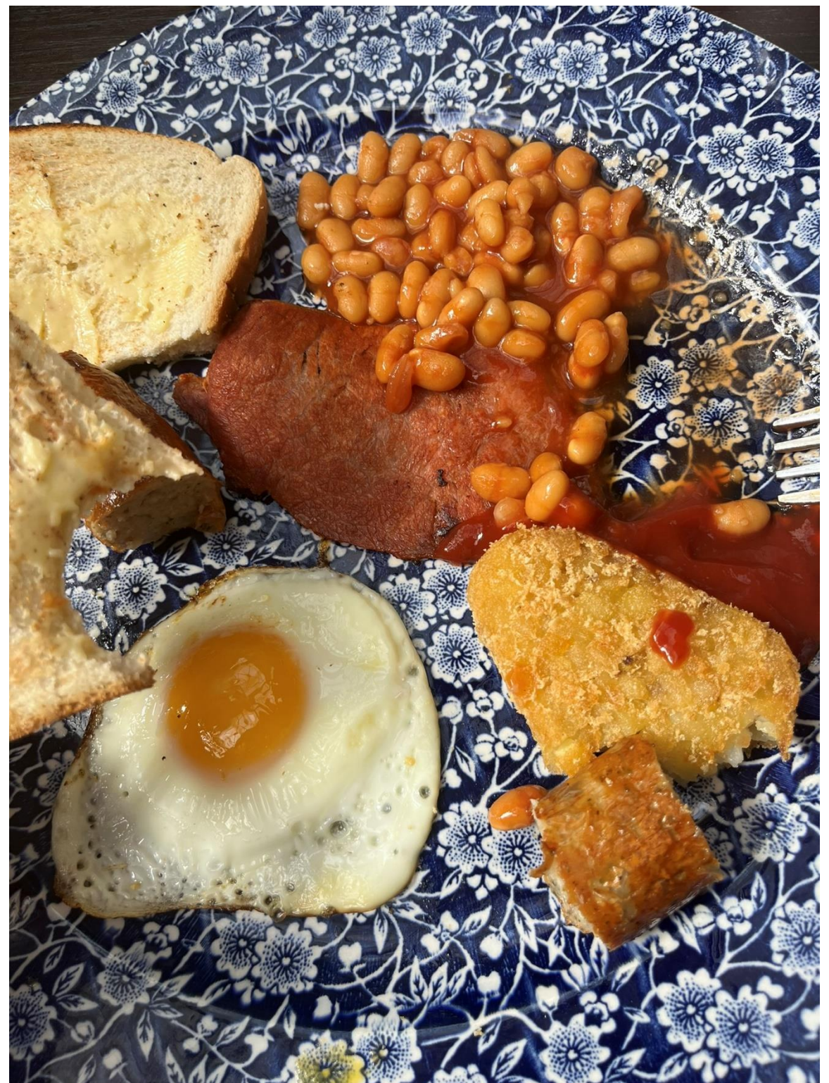
First english breakfast! Final decision: I don't hate beans