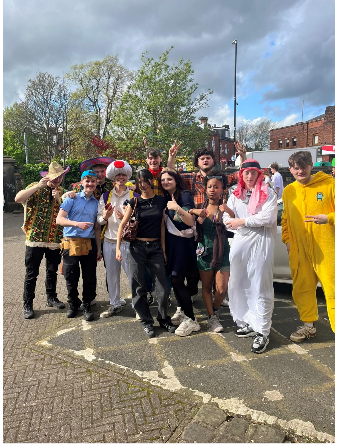
Otley run photos: Group picture