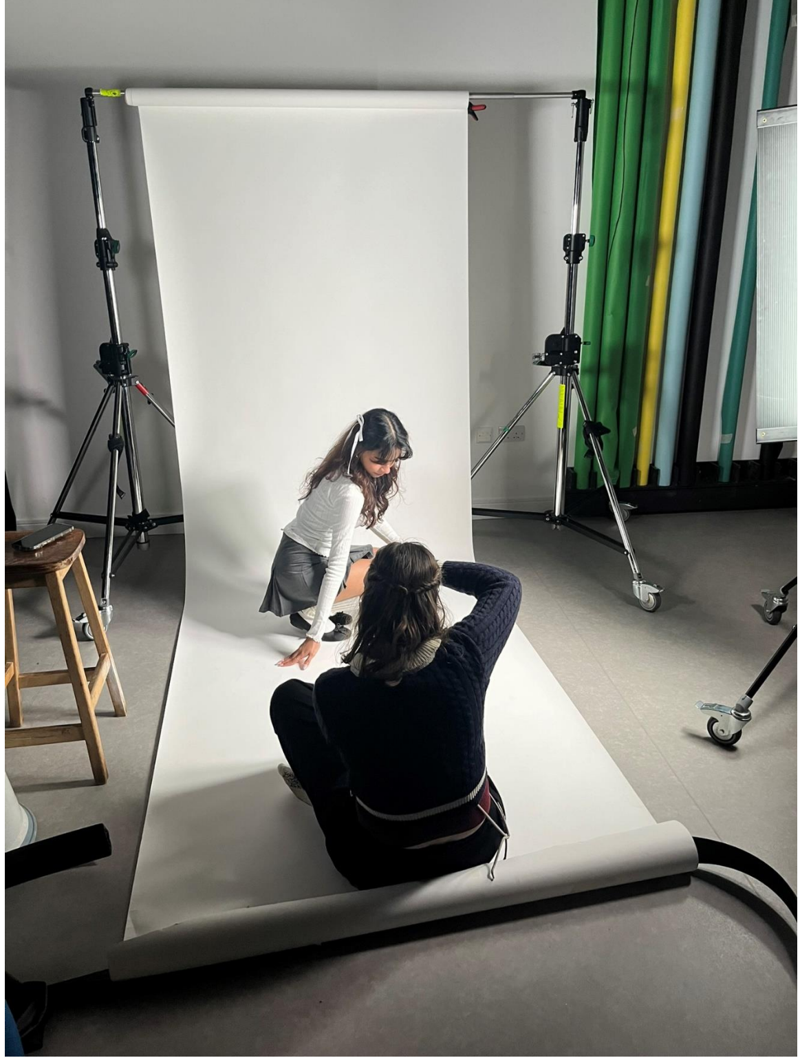
One of the photoshoots I did for my project