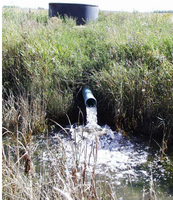
Figure 1. A pumped outlet may be required in areas that lack a natural gravity outlet.

Pumped outlets enable improved drainage at reasonable cost, in areas that lack a natural gravity outlet. A pump drainage system consists of a collection system (tile or surface drainage system), a pumping plant, and a free outlet. A typical pumping plant is shown