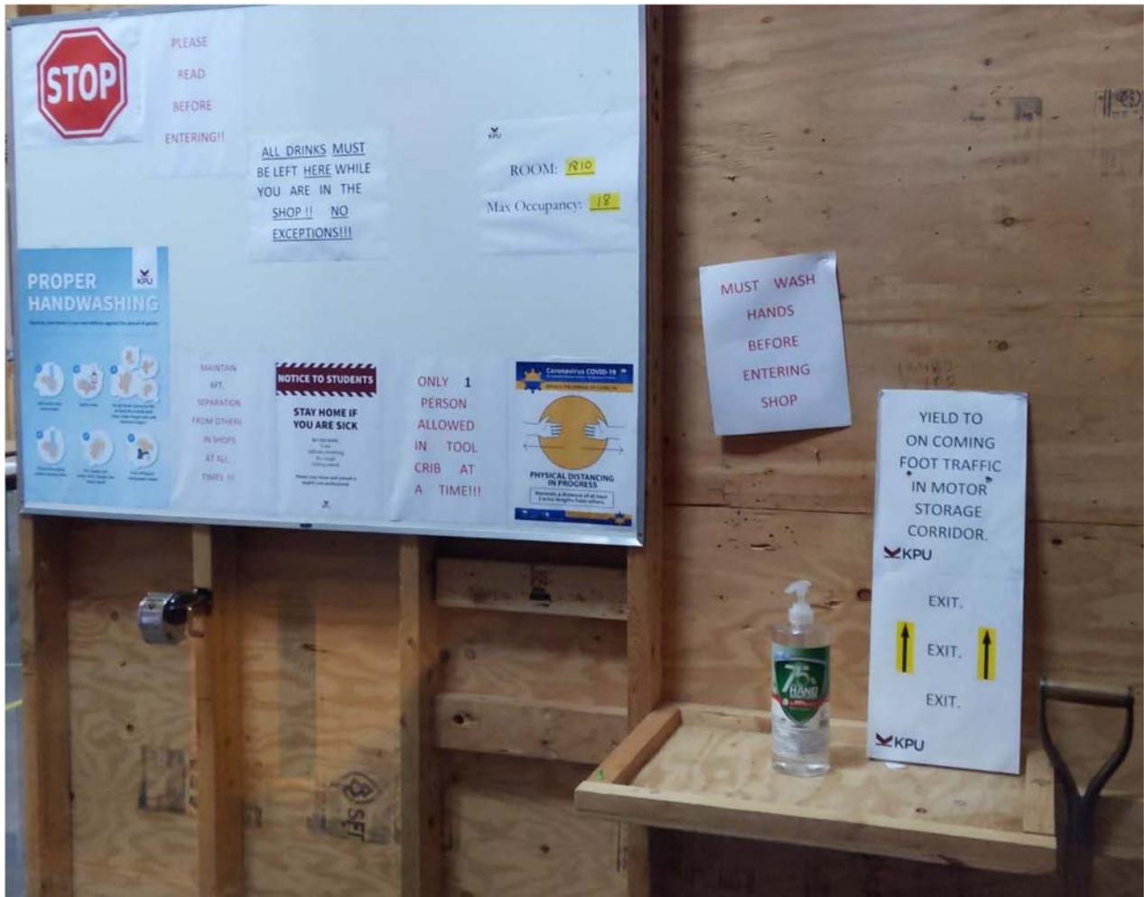
Signage at the entrance to the stop as well as hand sanitizer