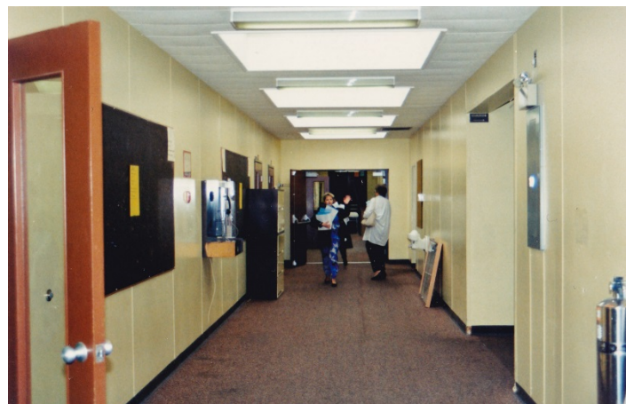
Inside the halls, complete with a pay phone.