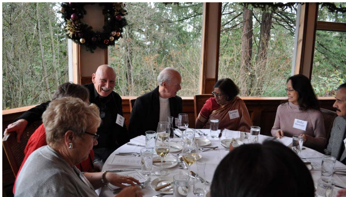
Some of us at the 2017 Festive Seasonal Lunch

Reserve Your Space: Please join us. Spouses and partners are welcome – your choice. Please let us know by 3 November if you plan to attend so we can reserve space for you. Send an email to KPURA.Events@gmail.com