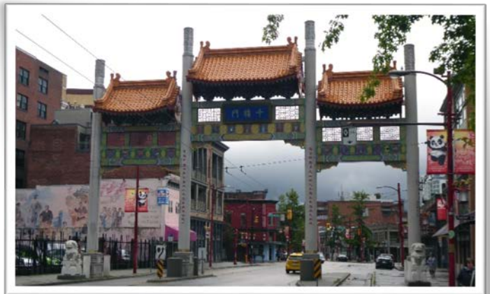
Entrance to Chinatown, Vancouver

We arrived at the Chinatown Gate just as the clouds started to break and spent the rest of the tour in increasing sunshine but still listening to the Noir narrative.