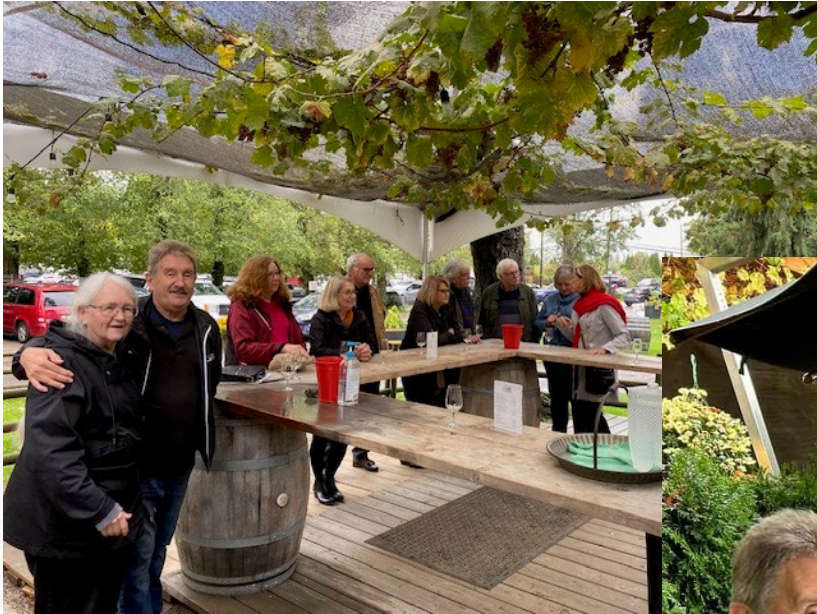
Country Vines, Richmond